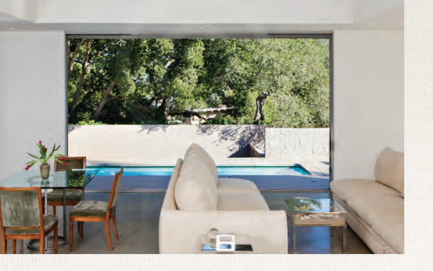
CAREFULLY CONSIDERED DESIGN... INSIDE AND OUT